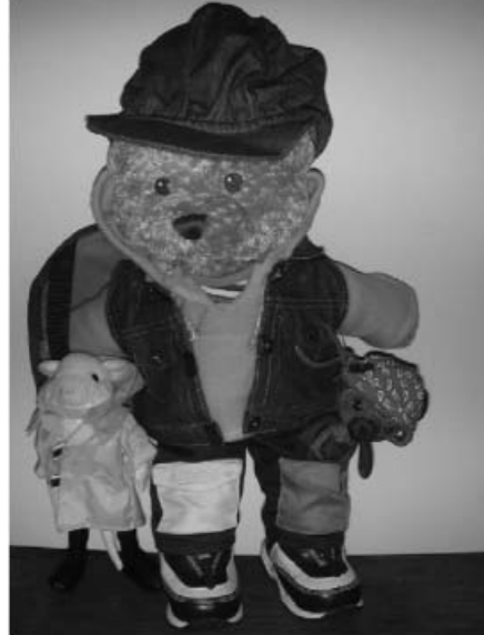
Fig. 1. Teddy bear, with and without accessories, used by Kuhn and Pease (in press).

do so. This content domain was selected to make it unlikely that superior performance on the part of the older group could be attributed to richer or more extensive content knowledge.